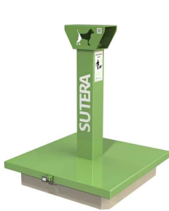
DS-1 Fully In-Ground Steel Lid 1 cu.yd. Capacity