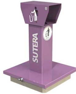
PRS-1 Fully In-Ground Steel Lid 1 cu.yd. Capacity