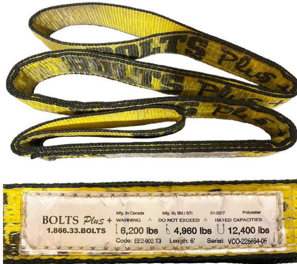
ITEM No.1: POLYESTER SLING FOR LIFTING (6 FT. LENGTH min. 6,200 lbs. CAPACITY)