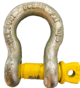
ITEM No.2: SCREW PIN SHACKLE FOR LIFTING (min. 7,100 lbs. CAPACITY)