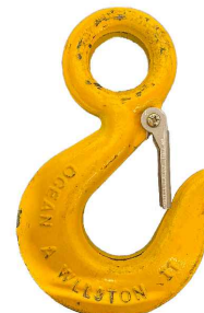
ITEM No.3: EYE HOOK FOR LIFTING w SPRING LATCH (min. 8,800 lbs. CAPACITY)