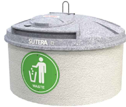
ISOMETRIC VIEW SCALE: 1/4" = 1'-0"